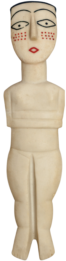
Copy of a marble female figurine with folded arms and painted details