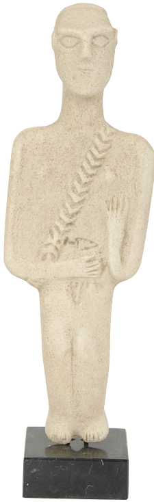
Copy of a male figurine depicting a hunter.