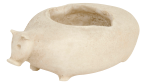
Copy of a zoomorphic pyxis (small jewelry box).