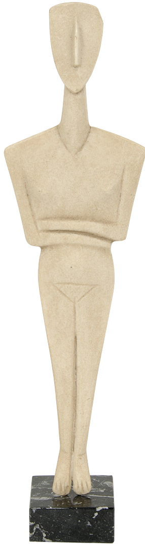
Copy of a female figurine with folded arms.