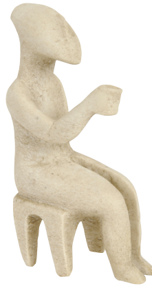
Copy of a male figurine seated on a stool and holding a cup.