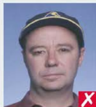
wearing a cap