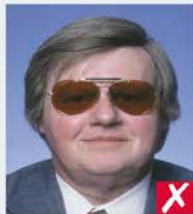
dark tinted lenses