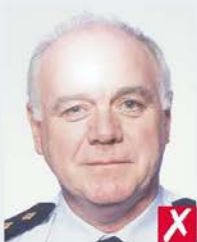
flash reflection on skin