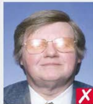
flash reflection on lenses