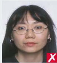
frames covering eyes