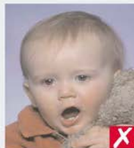
mouth open and toy too close to face