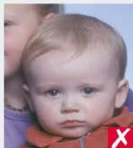
shows another person