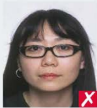
frames too heavy